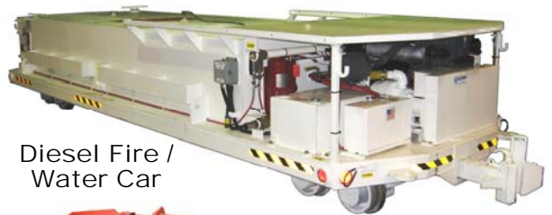
Diesel Fire / Water Car