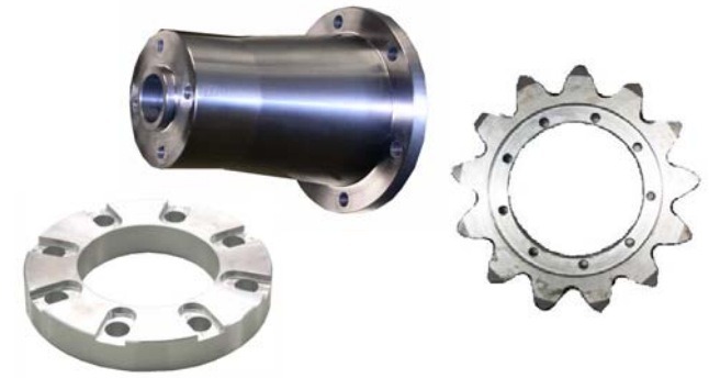
Drill Press, Slotter / Shaper Precision Grinding