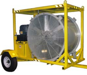
Diesel Powered Auxiliary Fans