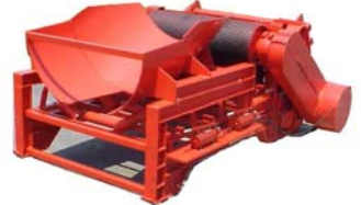
Belt Drives / Structure