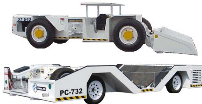
MINE ROVER Utility Equipment