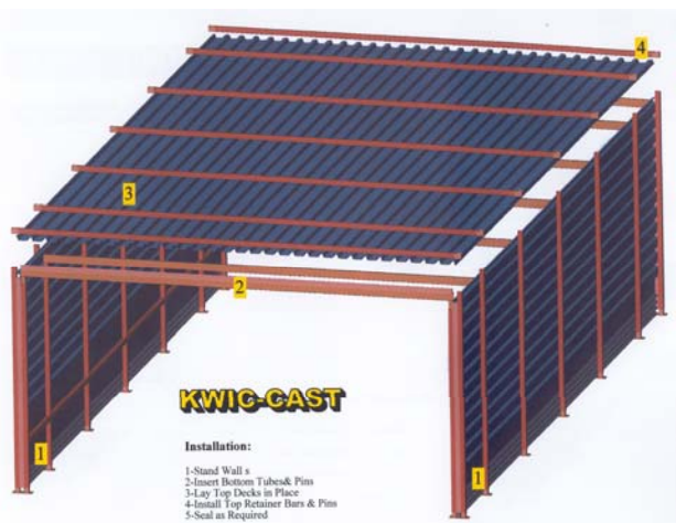
Kwic-Cast and Kwic-Door Products