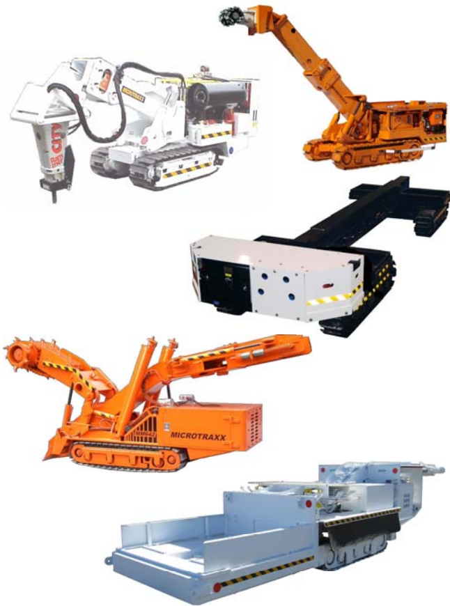
MICROTRAXX Mining Equipment