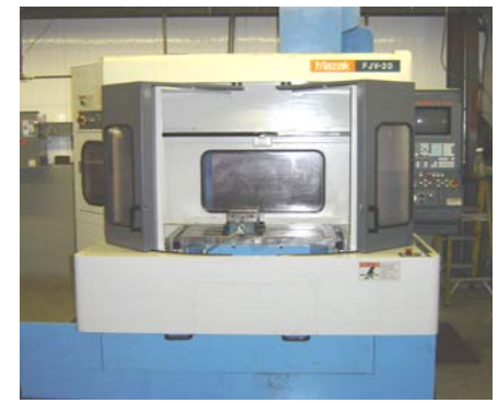
MAZAK CNC High Speed Vertical Machining Center