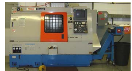
MAZAK CNC 3 Axis Turning / Milling Center