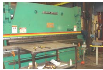
AccurPress with Auto Feed Control