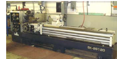
Willis Engine Lathe