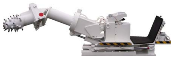
Custom Hydraulic Machines and Attachments