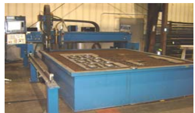
CNC Plasma and Oxy-fuel Cutting Torch