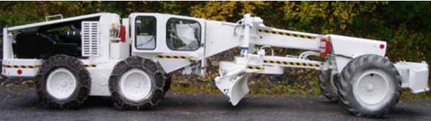
Equipment Repair / Rebuild